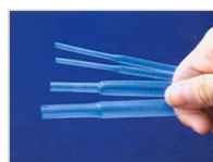
(1-4-8-fep-heat-shrink-tubing.html) FEP Heat Shrink Tubing (1-4-8-fep-