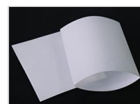
(1-4-7-polyolefin-heat-shrink-film.html) PET Heat Shrink Film (1-4-7-