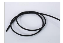
(1-4-6-diesel-resistant-heat-shrink-tubing.html) Diesel Resistant Heat Shrink Tubing (1-4-6-diesel-resistant-heat-shrink-tubing.html)