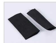
(1-4-5-heat-shrink-fiber-braided-sleeving.html) Heat Shrink Fiber Braided Sleeving (1-4-5-heat-shrink-fiber-braided-sleeving.html)