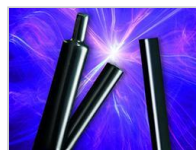
(1-4-3-heat-shrink-fluoropolymer-tubing.html) Heat Shrink Fluoropolymer Tubing (1-4-3-heat-shrink-fluoropolymer-tubing.html)