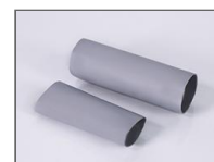
(1-4-10-silicone-rubber-heat-shrink-tubing.html) Silicone Rubber Heat