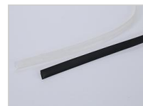
(1-4-2-heat-shrink-polyolefin-tubing.html) PVDF Heat Shrink Tubing for 175 °C (1-4-2-heat-shrink-polyolefin-tubing.html)