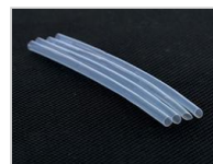
(1-4-4-ptfe-heat-shrink-tubing.html) PTFE Heat Shrink Tubing (1-4-4-ptfe-heat-shrink-tubing.html)