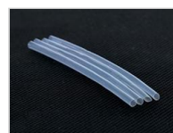
(1-4-9-pfa-heat-shrink-tubing.html) PFA Heat Shrink Tubing (1-4-9-pfa-