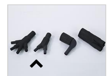
(1-4-11-heat-shrink-molded-shapes.html) Heat Shrink Molded Shapes (1-4-